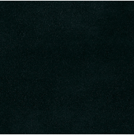
Black Velvet - 02