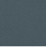
Twilight - 14